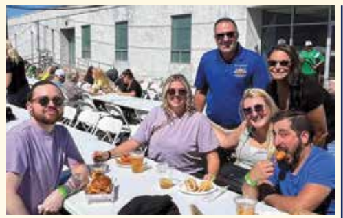
Catching up with old friends at the Cannoneers Sportsmens Club Block Party in September.