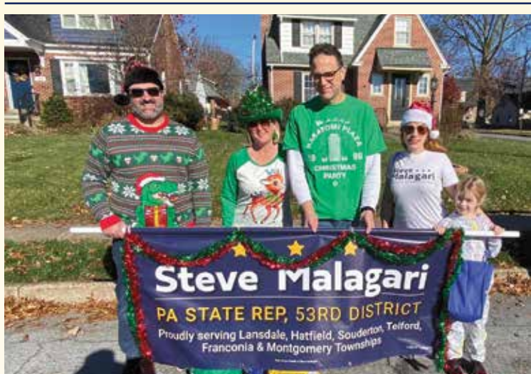
Lansdale Mardi Gras Parade.