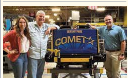
Previewing a new coaster design at Philadelphia Toboggan Coasters, Inc.