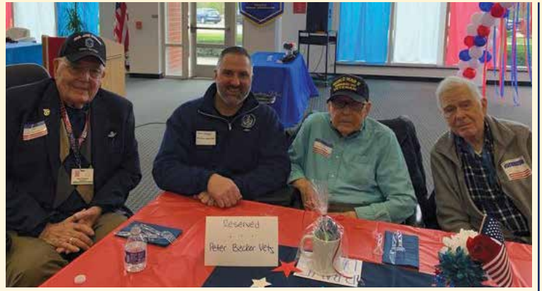
SASD Support Our Troops Veterans Brunch.