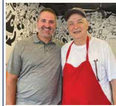
Visiting Peppe's Steaks in Souderton. So good!