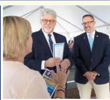
Celebrating the funding we secured for the North Penn YMCA's new gym.