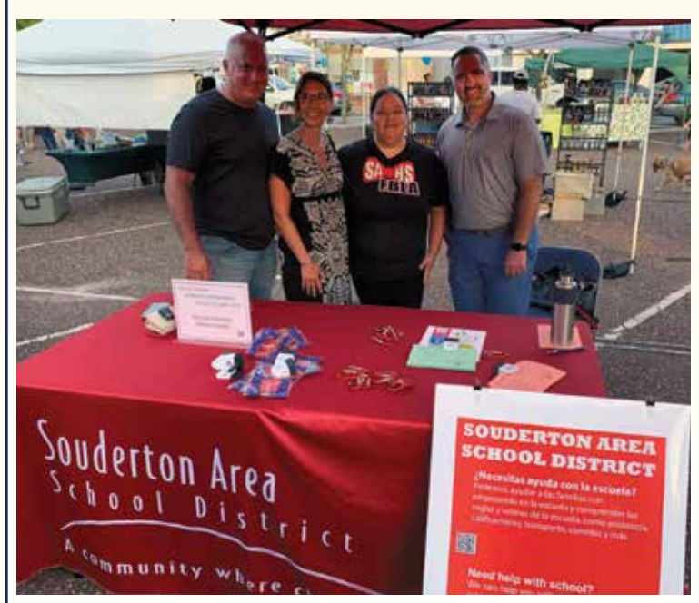
I had the opportunity to speak to some SASD teachers last September.