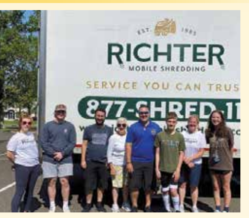
This year's Summer Shred Event was a success!