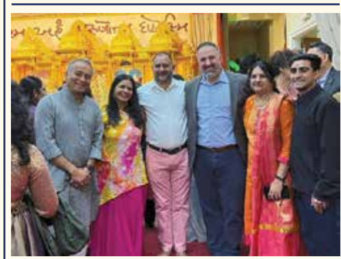
Diwali celebration at BAPS Swaminarayan Sanstha Mandir in Hatfield.