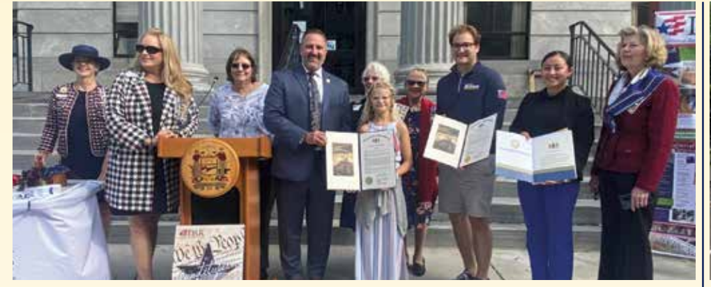
Constitution Week celebration with the Daughters of the American Revolution Towamencin Chapter.